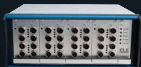
Fully configured 32 channel system (1 x EL27-1500 & 3 x EL27-1505)

The GDU logger uses a standard RS232 serial connection to communicate with the PC and the DS7 software.