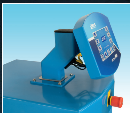
Tilt and turn screen