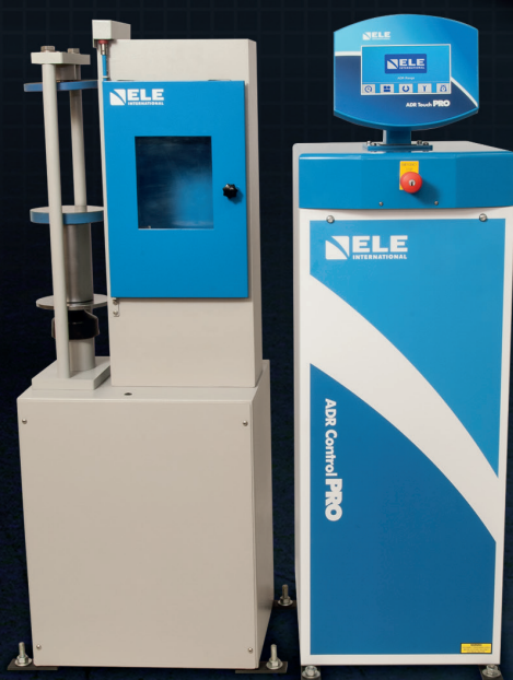
250/25 kN Cement Machine