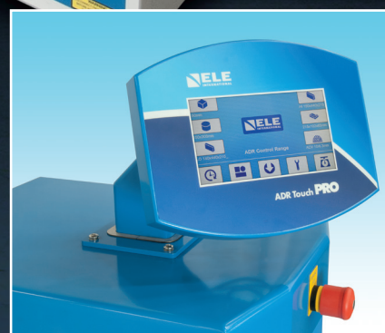
Favourites option available